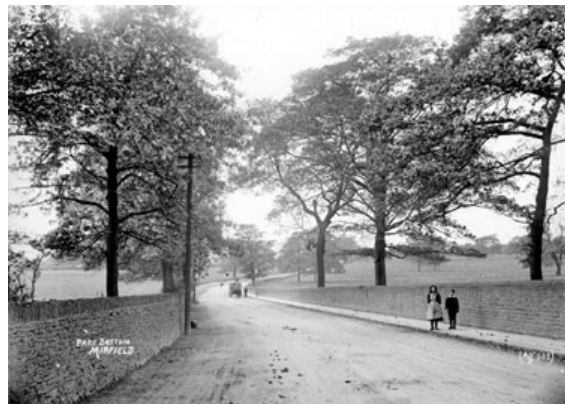
Two views of the Park Bottom area of Mirfield around 1900

Unfortunately, the local newspapers make no reference in 1894 or 1895 to the club having to move grounds due to the railway. Occasionally, there is reference to work being done on the railway as on 24 th July 1895 the Dewsbury Reporter commented "a good number of navies are at work at Northorpe and Battyeford."